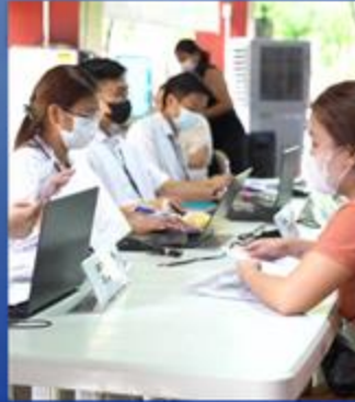
Pilot of Offline Authentication in Assistance to Individuals/Families in Crisis Situation