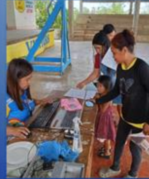
Registration and Authentication of 4Ps Beneficiaries during Family Development Sessions