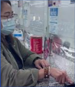
Civil Registry System basic Online Authentication