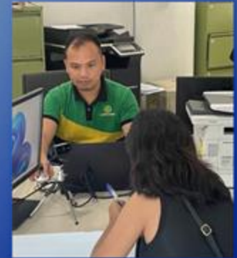
Pilot implementation of National ID Authentication Services at LandBank East Avenue Branch