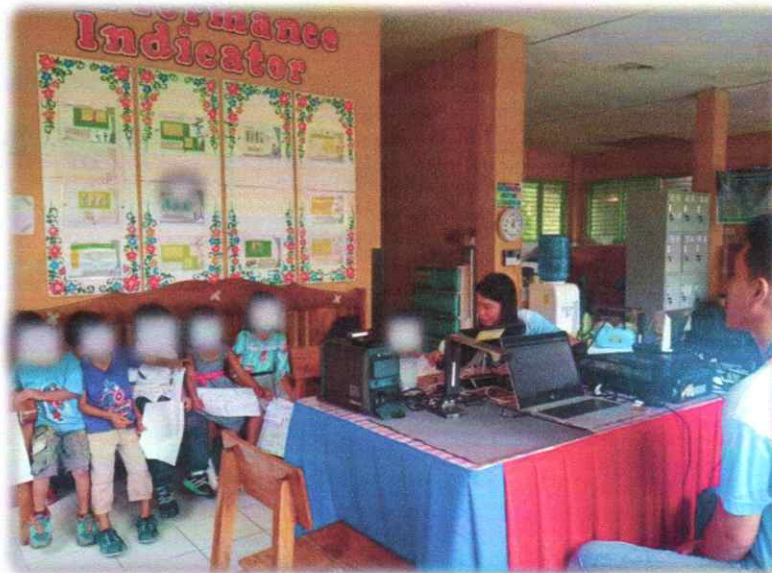
The pupils lined up for Step 2 Registration (biometric capturing) at Cantabon Elementary School, Cantabon, Siquijor, Siquijor

The Philippine Statistics Authority, Siquijor Provincial Statistical Office (PSA Siquijor-PSO) kickstarted the institutional registration and issuance of electronic Philippine Identification (ePhilID) for the Philippine Identification System (PhilSys) on 01 March 2023 in elementary and secondary schools both in private and public educational institutions in the province. In partnership with the Department of Education, Division of Siquijor, this initiative seeks to capture potential registrants among members of the academe, students, pupils, and family members.