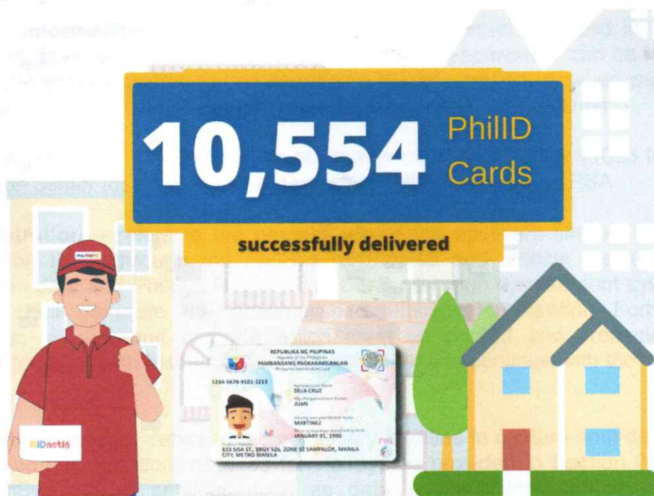
Figure 3: Total number of PhilID Cards successfully delivered by Philippine Postal Corporation (PHLPost)

With the continued partnership of the Philippine Postal Corporation (PHLPost), the official courier of the National ID, a total of 10,554 PhilID cards had been successfully delivered as of 31 January 2023. PHLPost delivers the PhilID for free to the registered address provided by the registrant.