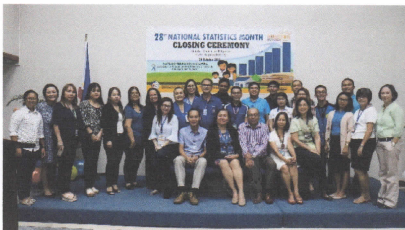
The participants of the forum