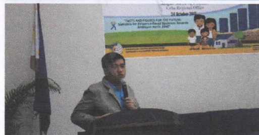
The presenters during the 28th NSM Closing Ceremony