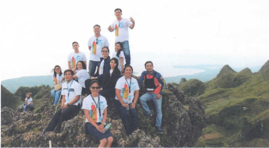
Technical Assessment at the breath-taking Omeña Peak

someday with his family to explore more of the town.