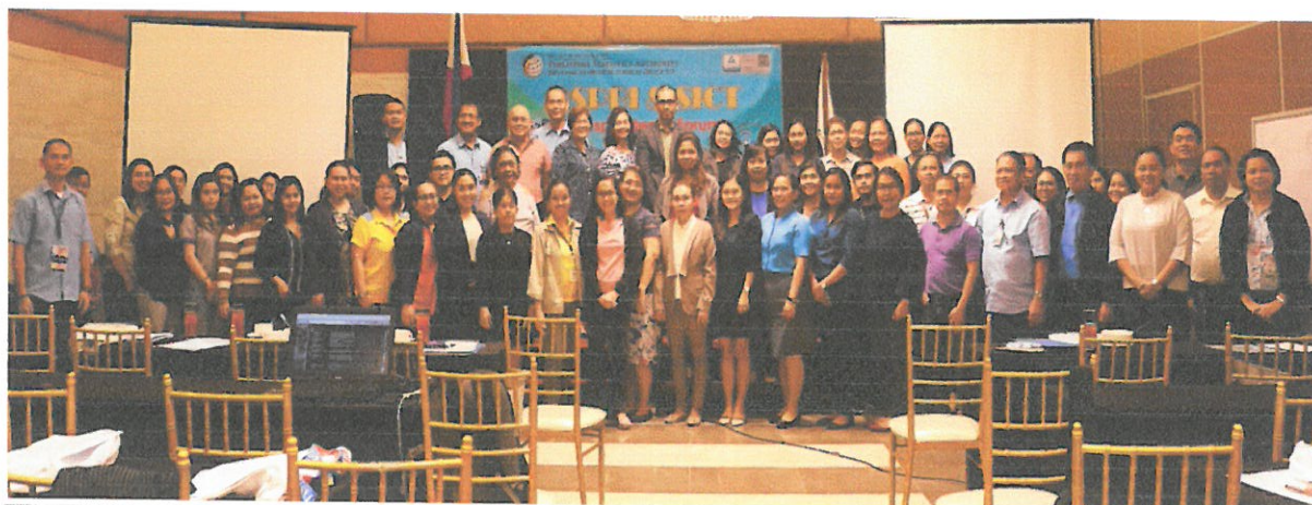
The representatives of the sample establishments from different provinces with the PSA Central Office and Central Visayas personnel.

The Quarterly Survey on Philippine Business and Industry (QSPBI) is one of the designated statistical activities of the Philippine Statistics Authority (PSA). It provides quarterly data on employment, compensation, revenue/sales and inventory for national accounts estimation. Relatedly, it aims to capture, collect and generate data for all the sectors of the economy except in agriculture sector.