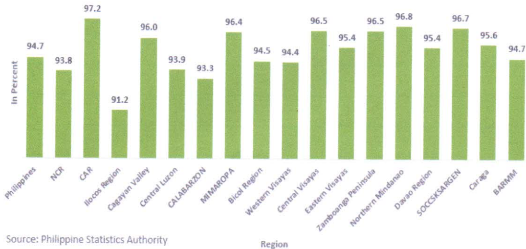
Figure 2. Employment Rate by Region, January 2020