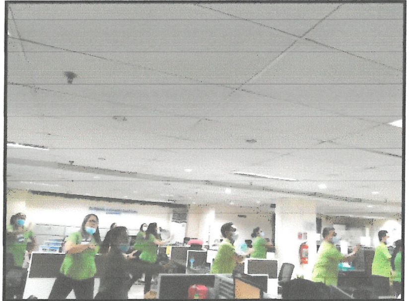
PSA-RSSO VII employees enthusiastically perform the ZUMBA

Among other activity conducted is the ZUMBA which was participated by PSA-RSSO VII employees. This is also a way of maintaining healthy well-being and showing that health is wealth. In this activity the employees were freely given the opportunity to show their talent in dancing. Much possible, smile and energy were visible in every participant. THEREFORE, the celebration generally aims to inspire and empower women and girls to be agents of change – to contribute to promote gender equality and the empowerment of all women.