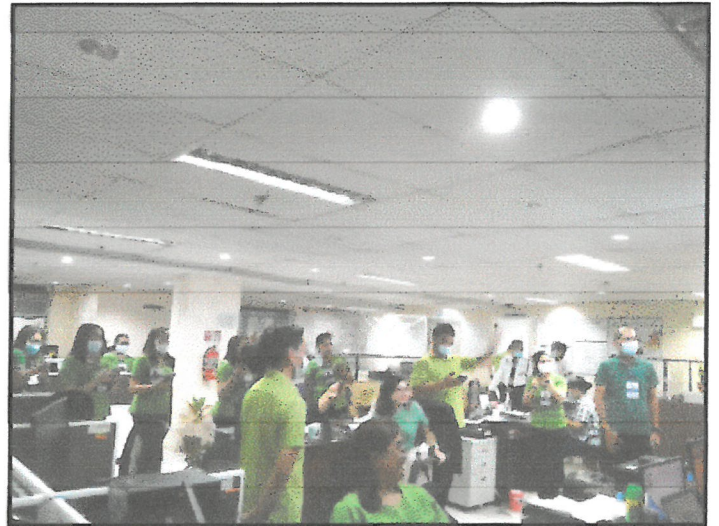
PSA-RSSO VII employees actively participate the trivia

The highlight of the activity was to showcase the employee’s hidden knowledge. To achieve this goal PSA-RSSO VII facilitates a trivia in form of a mobile application game called KAHOOT. The trivia was composed of various questions about women, laws, and privileges. PSA-RSSO VII employees were eager to join the activity. It was highly appreciated to sustain the camaraderie of everyone in sharing knowledge towards other.