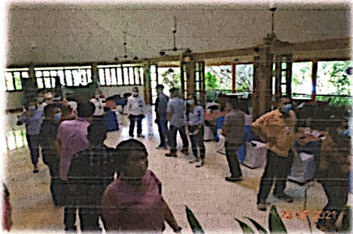
Team building activities participated by regular staff and COSWs.

The two-day activity was a successful one and can be best described as the product of well coordination and cooperation of every committee created from the preparation of the venue to the conduct of the different workshops and reporting whose members in every unit/division actively participated and showed interest and enthusiasm.