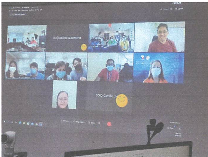
Trainers from PSA-Central Office with the Participants of Siquijor PO

Date of Release: 17 February 2022 Reference No.: 2022-NA07-001