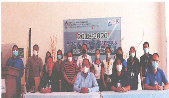
Photo opportunity of the onsite participants

most wanting sector of the society. He further added that the monthly LFS is in response to the need to know the current labor situation in the Philippines amidst the pandemic. PSA is committed to deliver quality and relevant statistics for equitable development towards improve quality of life for all Filipinos.