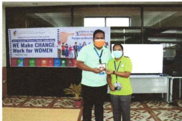
Photo of PSA staff upon receiving of token/prizes during the Monday Morning Trivia