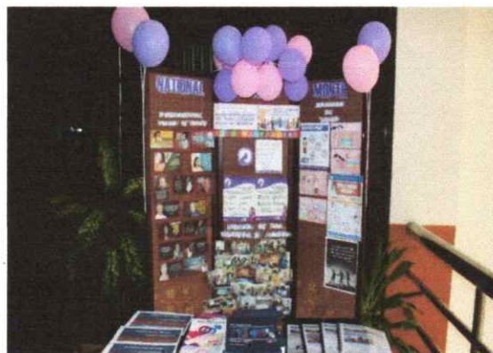
National Women's Month Bulletin board located at the 3 rd floor of the Siquijor Business and Convention Center

Different publication such as press releases, news article and statistics about women regarding population, life expectancy, work and education, violence against women, and, men and women statistics in the province of Siquijor were posted in a bulletin board located at the front of PSA office. A trivia was also conducted every Monday morning after-flag ceremony.