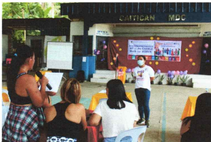
A participant reads her budget plan during the Lecture/Workshop on Money Management