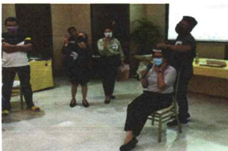
Pinoy Henyo Game

Needless to say, the training not only creates camaraderie, but it also creates a team that is working toward a common goal, as demonstrated on the second day of training when the admin organized a get-together dubbed as " Fellowship Night" that was attended by COSWs and regular employees, all of whom are working together to make each of their teams a winner. The success of the three (3) day training, will