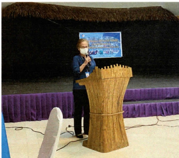
Chief Statistical Specialist gave her message on the first day of the session.

The Philippine Statistics Authority (PSA), Siquijor Provincial Statistical Office conducted Re-echo Training on GAD Concepts & Sexual Orientation Gender Identification and Expression and Sexual Characteristics (SOGIESC) and Basic Microsoft Excel and 2022 Mid-Year Performance Review Sessions on 21-22 of July 2022 at the Coco Groove Beach Resort, Tubod, San Juan, Siquijor. The purpose of the trainings is to re-echo the learnings by PSA personnel to their colleagues. On the other hand, the Mid-year Review Sessions assess 1 st semester 2022 performance, review its accomplishment and