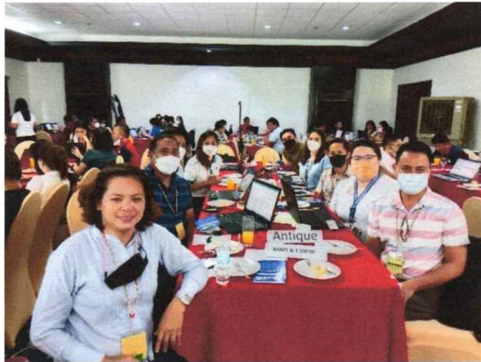
The MAQ-ESWW group during the group discussion and hands-on exercises.