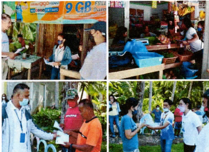
CBMS personnel interacting with the would-be respondents and giving the CBMS flyers, brochures and primers.

support and higher participation rate from each household residing in the locality during the data collection phase of the 2022 CBMS operations.