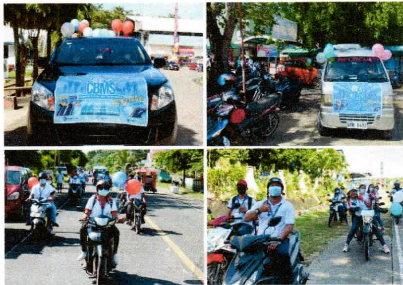
Touring around the major roads of the sample barangays and doing stopovers with a great volume of residents.

After the short program, touring around the major roads of the participating municipalities while playing the official CBMS Jingle was done. Stopovers were made especially at the sample barangays, where CBMS will be operationalized, with a great volume of residents to interact with the would-be respondents while giving the CBMS flyers, brochures and primers.