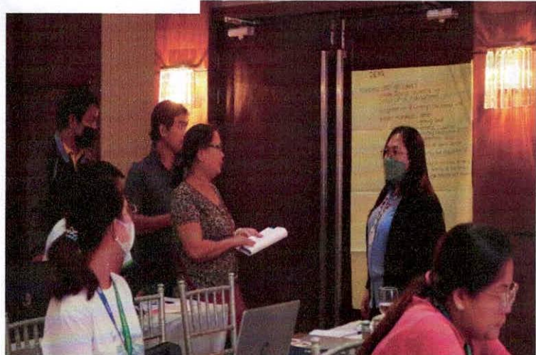
DENR staff elaborates their mandates and clarifies their role in data collection.

The three-day training was incorporated by a workshop that was done by all the physical attendees and discussed the output to the group. All agencies participated and shared their data collection and mandates. An open forum was done after the presentation for better understanding of the objectives of the training/workshop.