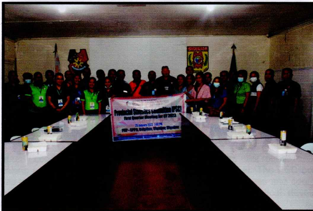
Attendees of the PSC First Quarter Meeting.

25 January 2023 – PNP SPPO, Caipilan, Siquijor. The Provincial Statistics Committee (PSC) of Siquijor Province conducted the First Quarter Meeting for CY 2023 on 25 January 2023 held at the Philippine National Police - Siquijor Police Provincial Office (PNP SPPO), Caipilan Siquijor. The meeting was attended by 21 out of 28 member agencies with the Department of Information and Communications Technology (DICT) and the Municipal Planning and Development Offices (MPDOs) of the 6 respective LGUs of Siquijor province as the new member agencies of PSC