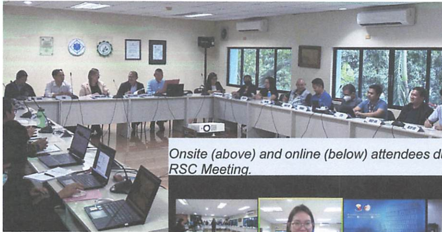
Onsite (above) and online (below) attendees during the first quarter 2024 RSC Meeting.