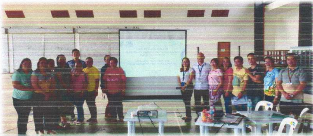
The participants of the orientation together with the facilitators of PSA – Siquijor Provincial Statistical Office held at the Evacuation Center, Poblacion Norte, Maria, Siquijor on 13 May 2024.

The Philippine Statistics Authority (PSA) successfully conducted an LGU orientation focused on the 2024 Census of Population (POPCEN) and Community-Based Monitoring System (CBMS) Barangay Profile Questionnaire (BPQ) Data Collection at the Evacuation Center in Poblacion Norte, Maria, Siquijor on 13 May 2024. This one (1) day activity aimed to equip barangay secretaries with essential skills and knowledge for effective data collection and service facilities and government projects listing in every barangay.