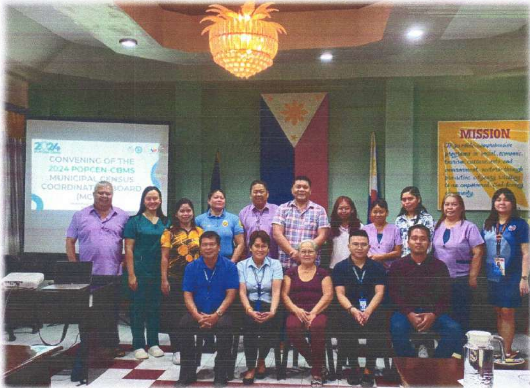
Members of the 2024 POPCEN-CBMS Municipal Census Coordinating Board (MCCB) of the Municipality of Larena during the convening of the MCCB at SB Session Hall, Poblacion Norte, Larena, Siquijor on 16 May 2024.

The Municipality of Larena successfully convened its 2024 Census of Population (POPCEN) and Community-Based Monitoring System (CBMS) Municipal Census Coordinating Board (MCCB) on 16 May 2024, paving the way towards the simultaneous conduct of 2024 POPCEN-CBMS of the Philippine Statistics Authority. The meeting, held at the at SB Session Hall, Poblacion Norte, Larena, Siquijor, was well-attended by the members of the MCCB.