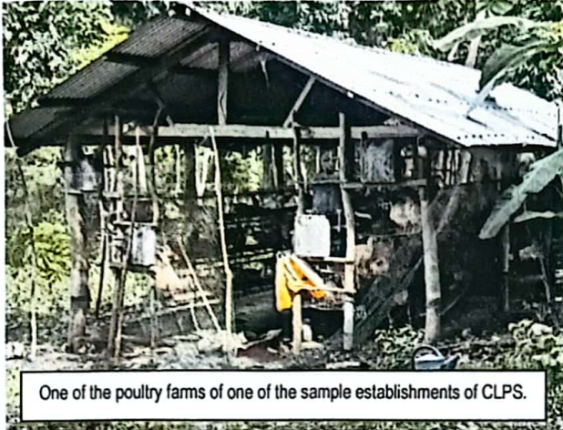
One of the poultry farms of one of the sample establishments of CLPS.

The data generated from these surveys are disseminated through statistical tables, quarterly bulletins, annual situation reports, infographics, and publication. More importantly, the production data generated from the survey are direct inputs to the valuation of production in Philippine agriculture and fisheries, and accordingly to the computation of Gross Domestic Product (GDP).