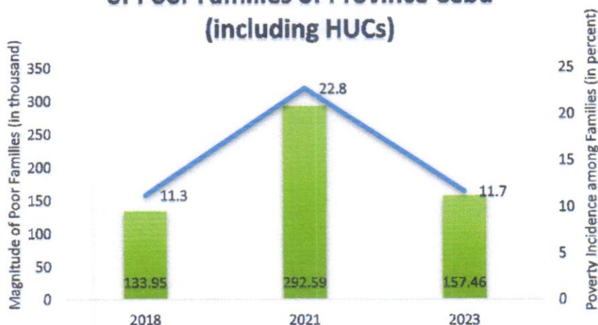
Figure 1. Poverty Incidence and Magnitude of Poor Families of Province Cebu (including HUCs)

The 2023 Family Income and Expenditure Survey (FIES) which concluded in July 2023 (collected income data from January to June 2023) and January 2024 (collected income data from July to December 2023), indicate that 11.7 percent, or approximately 157,460 families in the Province of Cebu, including the three Highly Urbanized Cities, experienced poverty in 2023. This represents the proportion of families whose incomes are insufficient to meet their basic food and non-food needs, as estimated by the poverty threshold. This year's poverty incidence among families has decreased by 11.1 percentage points from its 2021 level of 22.8 percent, or approximately 292,590 families, but increased by 0.4 percentage points from its 2018 level of 11.3 percent, or approximately 133,950 families. (Figure 1)