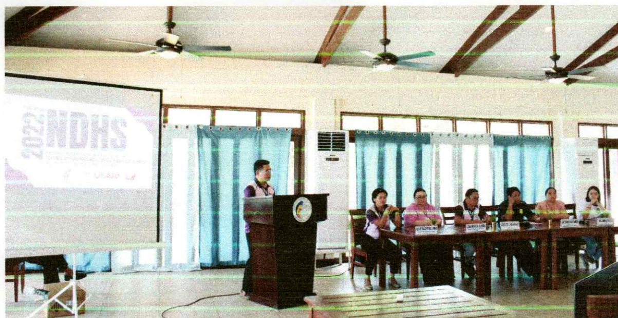
Presenters and discussants during the open forum

An open forum was set to cater questions and clarifications raised by representatives/attendees from the National and Local Government Line Agencies.