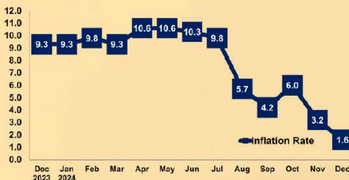
Fig. 1. Inflation Rates for the Bottom 30% Income Households: Bohol, Dec 2023 to Dec 2024