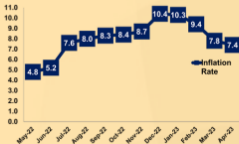
Fig. 1. Inflation Rates: Bohol, May 2022 to April 2023