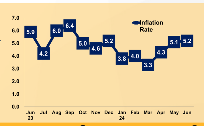
Fig. 1. Inflation Rates: Bohol, June 2023 to June 2024