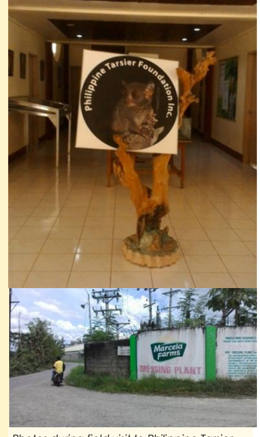
Photos during field visit to Philippine Tarsier Foundation Inc. (top) and Marcela Farms Dressing Plant (bottom)

number of samples. The sum of the revenues of all products must be consistent to the revenue in CPBI. Only in IOSPBI that the products expenses, and inventories are segregated. Out total the sample establishments in Bohol for CPBI only 18.5 % are IOSPBI samples.